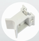
Pole mounting bracket