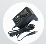
24V 0.8A Adapter