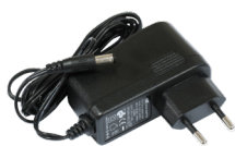
24 V 0.38 A power adapter

For links up to 200 meters, this is the best alternative for wireless connections where 2 and 5 GHz wireless space is crowded and unreliable, at a fraction of the cost. Small, lightweight, compact and very affordable, this is a 60 GHz device like no other before.