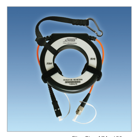
Fiber Ring, MM - 150 m