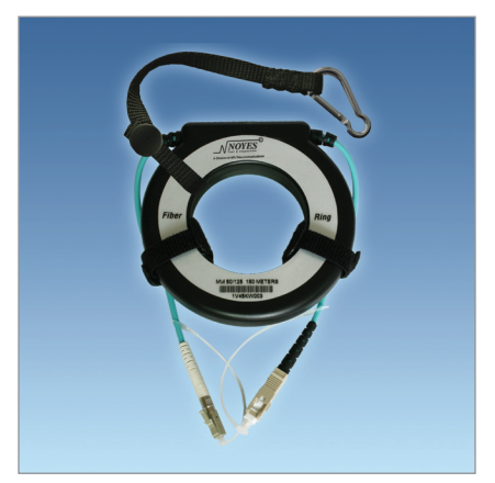
Fiber Ring, Laser Optimized